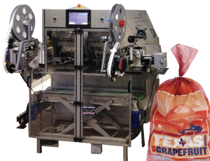
PEB61 Wicketed Bagger